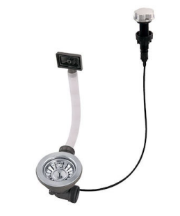
Automatic waste fitting 8407 100