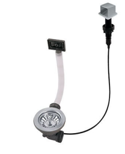
LIRA automatic waste fitting 8407 103